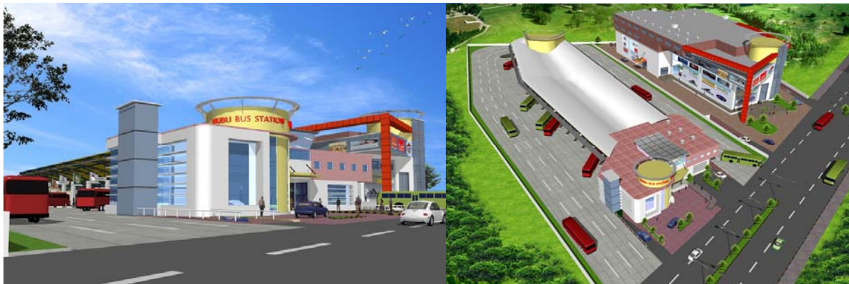
Note: Indicative views of Proposed Bus Station cum Passenger Amenities & Commercial Development