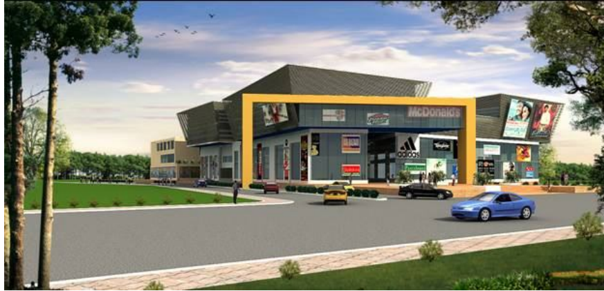
Note: Indicative view of Commercial Development