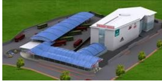
Note: Indicative view of Integrated Bus Station cum Commercial Development