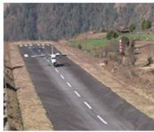
NSOP Services and Chartered Flights