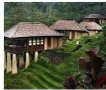
Resorts/Hotels/Other Commercial Development