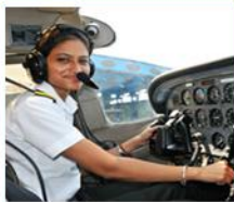
Flying Training Institute